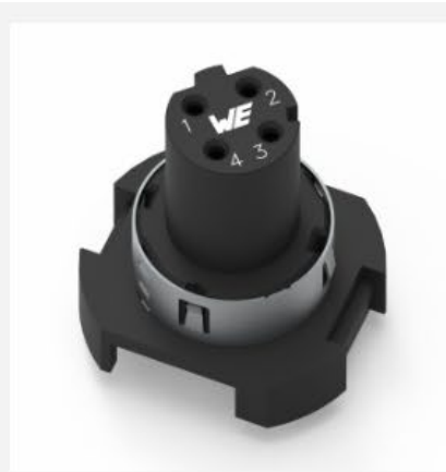
D-coded M12 (IEC61076-2-101) made of high-performance plastic (LCP) for best dimensional stability and temperature stability during reflow