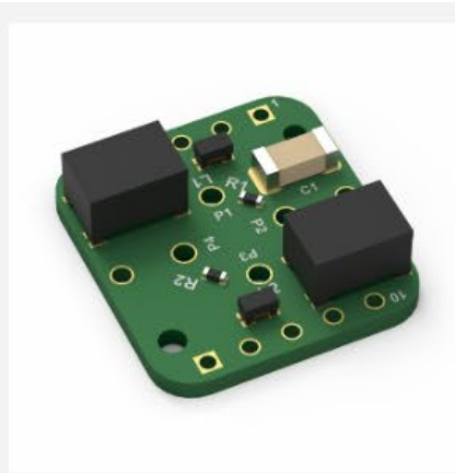
Integrated filter design for 10/100 Base-T Ethernet applications according to IEEE 802.3u