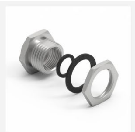
Metal housing with internal (M12) and external (PG) thread.