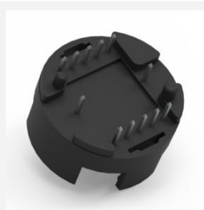
LCP bottom with THR pins and high spacers/standoff (1.4 mm) for optimum air circulation during soldering process

Due to the integrated transformers and common mode chokes, the LAN-MX combines high mechanical robustness with excellent signal integrity in one component.